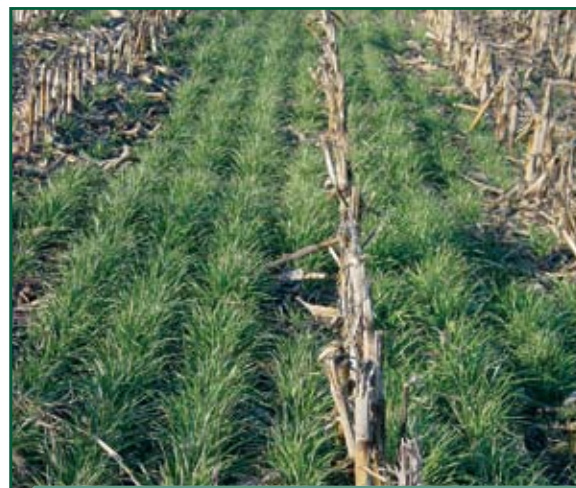
With Annual Ryegrass, corn production more than doubled that planted with no cover crop in a dry year.