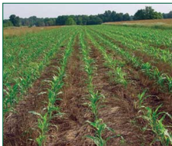
Converting to no-till with cover crops requires new management know-how.

Mention of any product does not constitute an endorsement or guarantee.