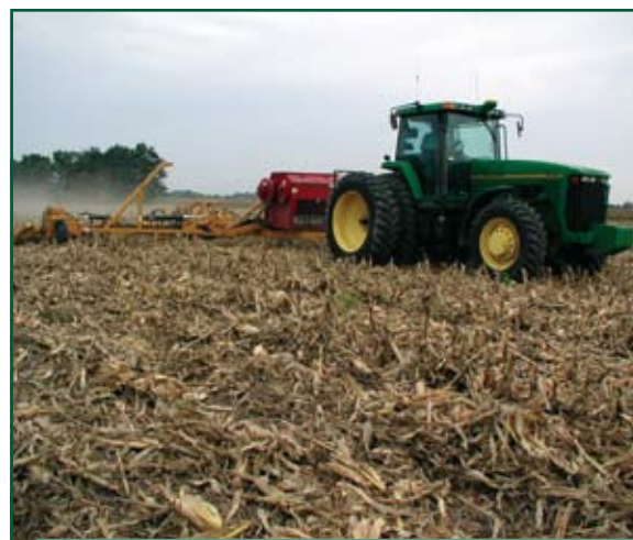
Annual Ryegrass reduces the need for tilling, thus reducing tractor hours and the amount of fuel used.

Results on farms, especially in years of dry weather, show that use of Annual Ryegrass as a cover crop increases yields if properly managed. Results will vary depending on soil type and weather conditions. More information on this benefit is covered as a separate topic elsewhere in this guide.