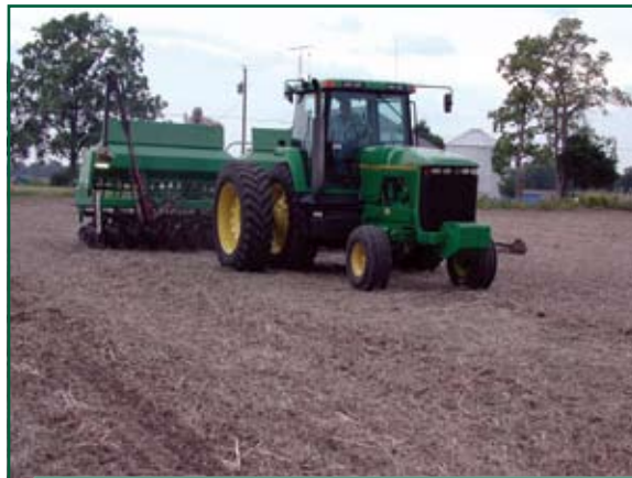
Growers who plant after wheat or corn silage may be able to graze or take a cutting of haylage in the fall or spring.

Using a no-till drill (preferred) or other methods, dormant seed in late November through early February. Some growers have had good stands in the spring using a dormant seeding, whereas an October seeding resulted in germination but left the Annual Ryegrass too small to overcome harsh winter weather. Snow cover helps. However, burndown of a dormant Annual Ryegrass