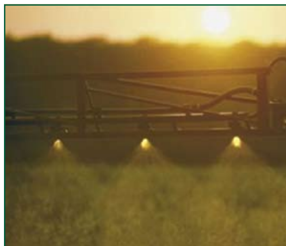
Flat fan nozzles are best for burndown application on Annual Ryegrass.