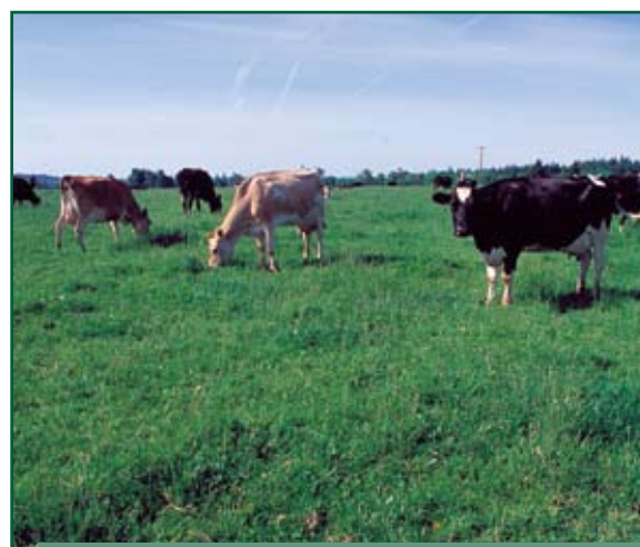
Growers who plant after wheat or corn silage may be able to graze or take a cutting of haylage in the fall or spring.