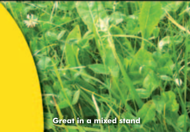
Great in a mixed stand

For more than 100 years, Great in Grass® 800.547.4101 • www.barusa.com