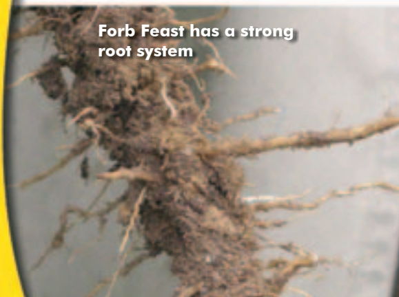
Forb Feast has a strong root system

Forb Feast chicory performs well in less than ideal conditions. Chicory is a deep rooted plant that prefers light to medium soils that are at least moderately drained. Chicory will persist under minimal fertility levels and can tolerate a broad range of conditions. However, with high fertility and appropriate fertilization, Forb Feast will produce impressive yields.