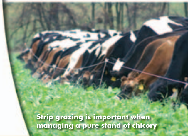
Strip grazing is important when managing a pure stand of chicory